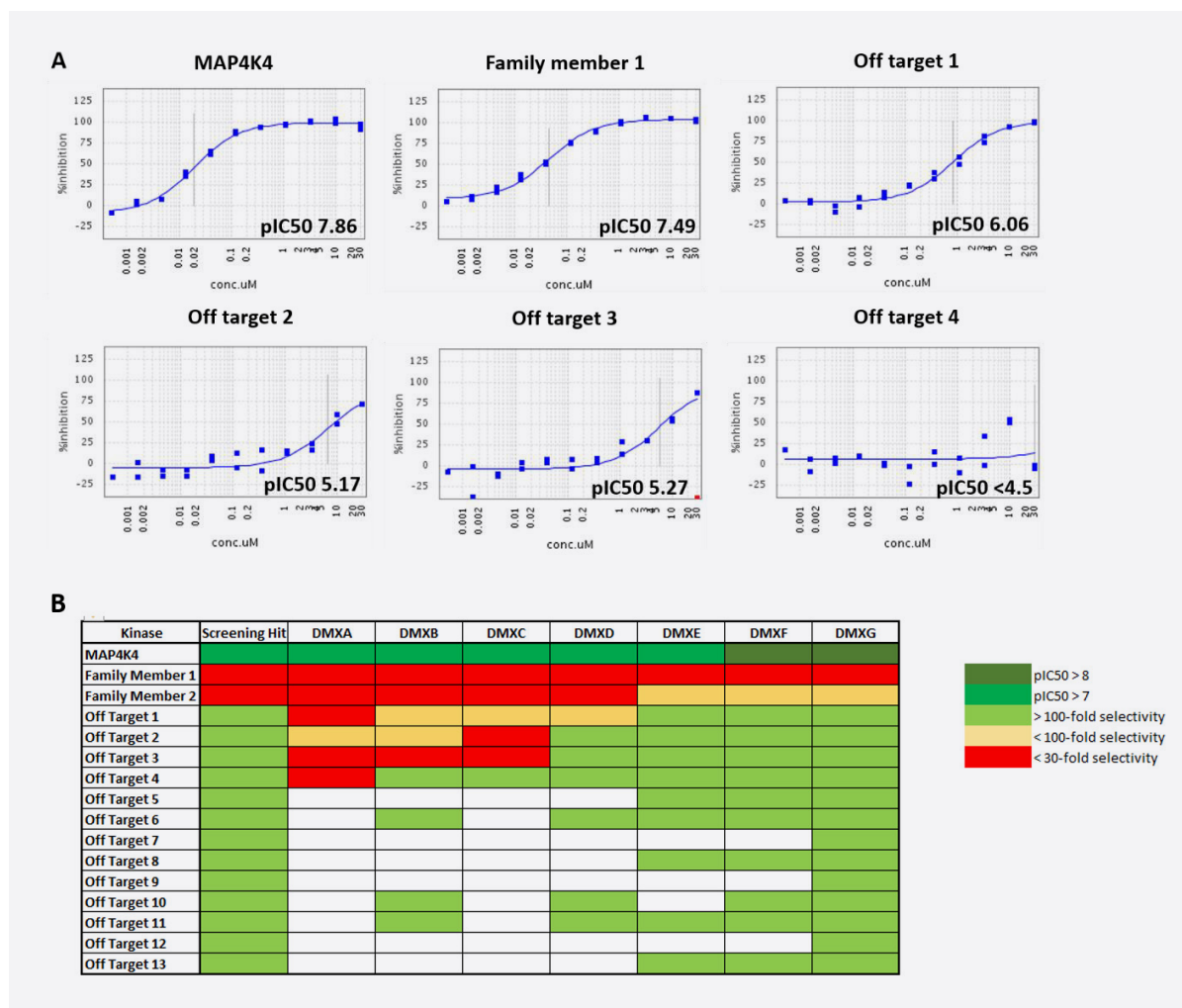
Figure 3: Routine screening: (A) Inhibition curves of one MAP4K4 inhibitor during the development process for MAP4K4 and several selectivity kinases. (B) Selectivity profile improvement for selected off-target kinases across several design-make-test cycles.

Fifteen or more compounds were tested per week during the hit to lead and lead optimisation stages of the project. Screening of compounds against MAP4K4 and a panel of 15 off-target kinases was performed in 384-well format. The most promising compounds were profiled more widely against additional kinases, and other enzymes and receptors. An example of kinase screening data for one compound is shown in Figure 3A, and the improvement in the selectivity profile through multiple rounds of compound optimisation from 'DMXA' to 'DMXG' is shown in Figure 3B.